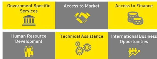
Figure 2: Pillars of entrepreneurial support