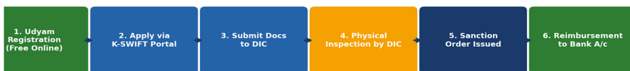
Figure 6: Step-by-Step Process for Availing Kerala MSME Incentives (Budget 2026: Corporate Mitras assist compliance)